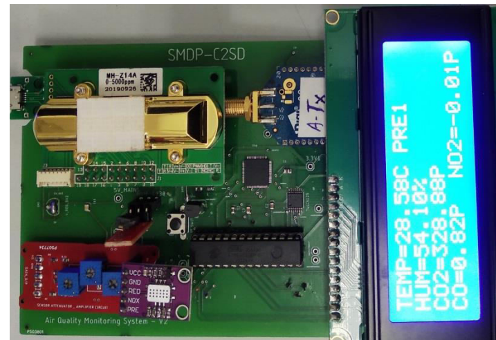
Single Board AQMS