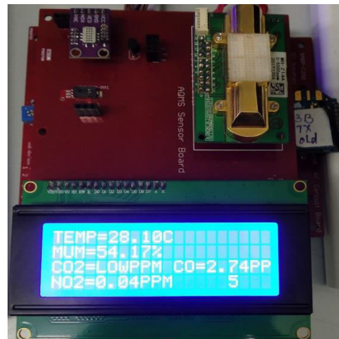
3 Boards AQMS